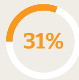
ESTIMATED TO HAVE 4G SPEEDS