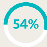
ESTIMATED WITH UNLIMITED ACCESS