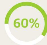
ESTIMATED TO OWN A SMARTPHONE