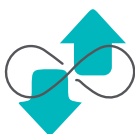
UNLIMITED ACCESS POINT