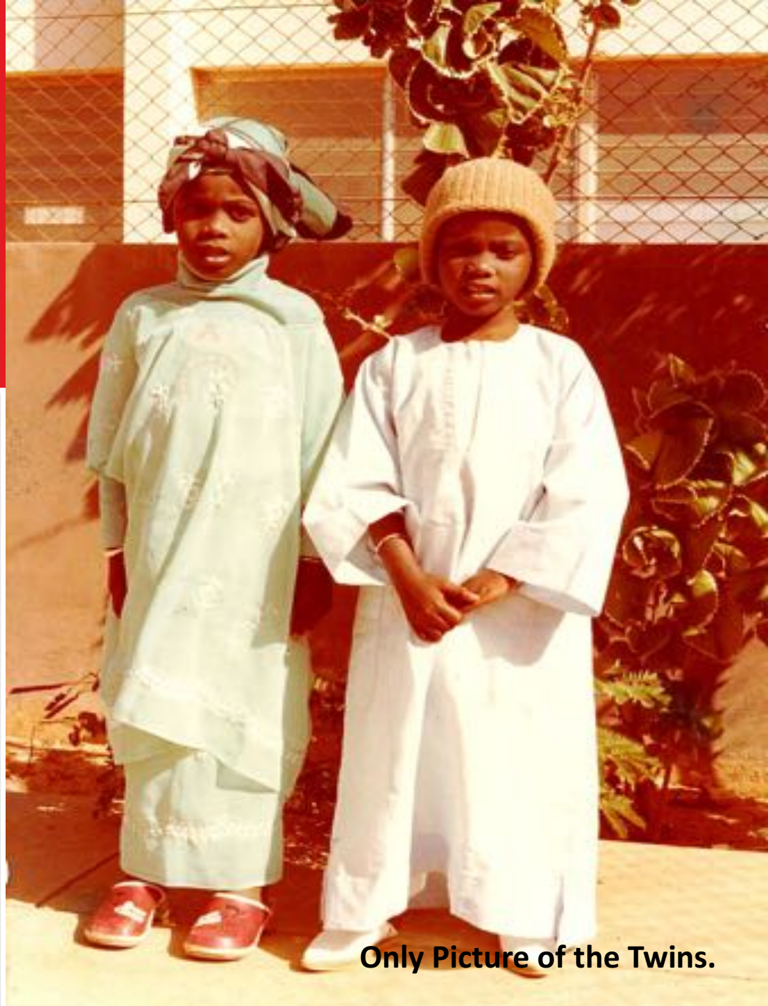
Only Picture of the Twins.